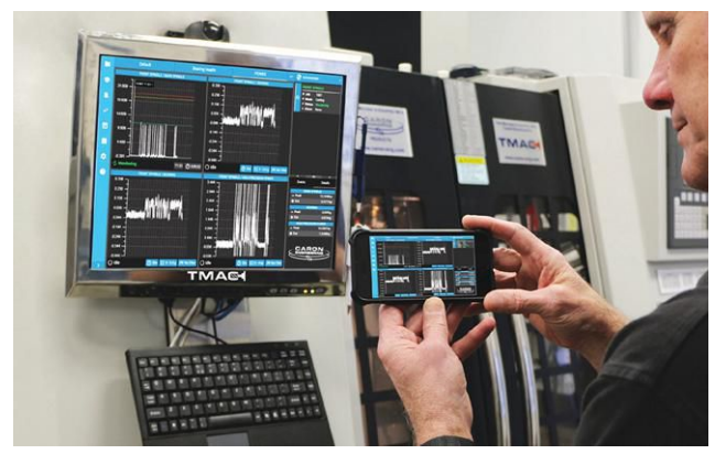
Caron Engineering's TMAC system can display multiple sensor channels at the same time, even on a handheld device.

Aerospace machine tools appear to be on the cusp of big changes. Walker suggested machines are becoming more specialized for certain high-volume areas like aerospace-grade aluminum. Here you want high-horsepower, high-torque, high-speed machines that "just remove an incredible amount of material but aren't well suited for cutting titanium or nickel alloys," according to Walker.