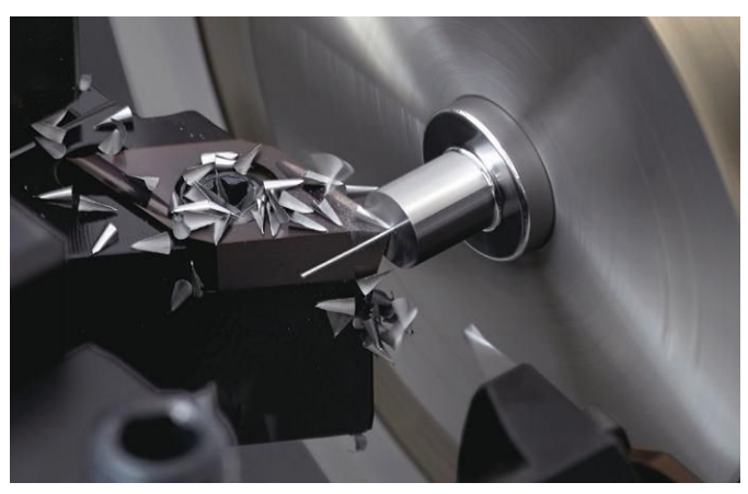
Citizen's low-frequency vibration technology oscillates the Z axis while cutting to consistently break chips.

But he also pointed out that excessive vibration sometimes occurs at lower than ideal operating speeds. The counter-intuitive solution is to run harder and faster to find the sweet spot. Finally, he suggested prospective buyers consider a machine builder's reputation in meeting tolerances and MRRs. Examine what machines the OEMs and their suppliers are using for the same applications. "A machine is usually aimed at doing tight tolerance work or